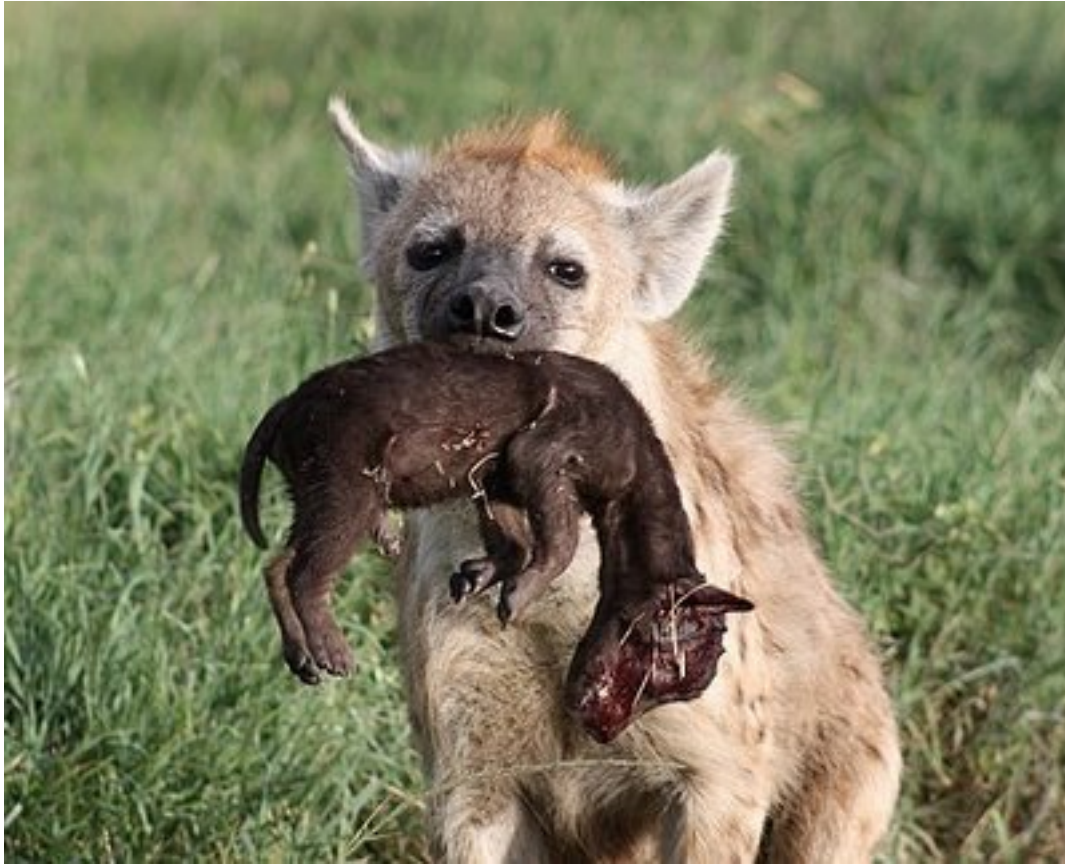
Cub's head crushed most likely by sibling

Furthermore, mothers do not even intervene in these fatal contests for dominance. Because of this violent practice, baby hyenas are often identified as the Cain and Abels of the mammals. Also, it is reported that, here again, it is often the female that prevails in the battle. The resulting death rate from this siblicide is reported to be anywhere from nine to twenty-five percent. However, one researcher observed that at a few weeks of age, "more than forty percent of the litters comprised lone cubs." This practice is documented in the opening portion of the video, "Survival Guide," as well as in a segment of "Eternal Enemies."